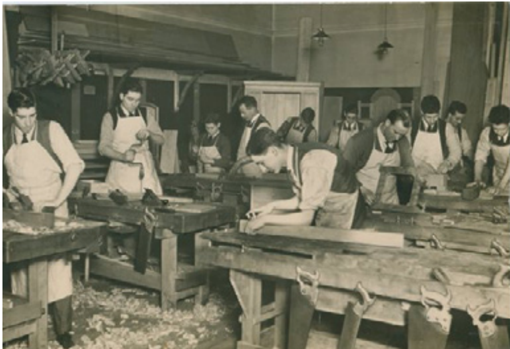
A group of students learn carpentry during the 1920s

DMU has halved its energy-related carbon emissions one year ahead of target, an achievement announced at the 2020 Sustainable Development Goals Conference. The university has also recycled 91% of its non-residential waste. DMU is ranked in the top 50 universities in the world for sustainability in the Times Higher Education rankings.